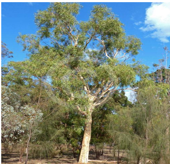
Corymbia arrerinja - ghost gum