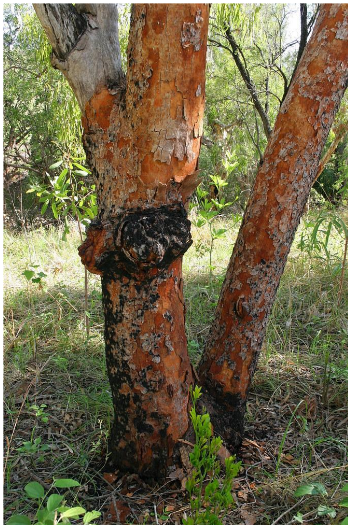
Corymbia opaca - Desert bloodwood