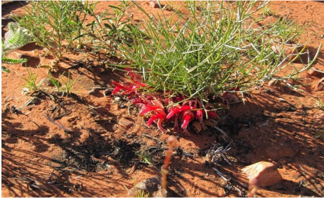
Leptosema chambersii Upside down plant